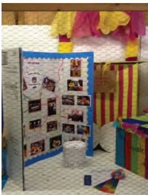
Navy CYP displays club project at the state fair and wins Best in Show!