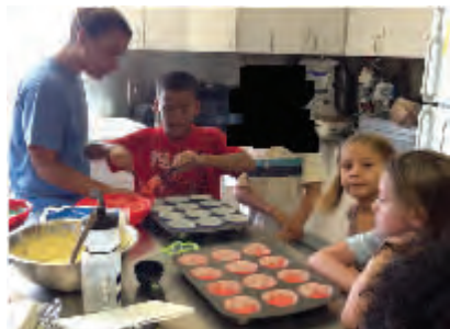
Constructing the final product as a team.