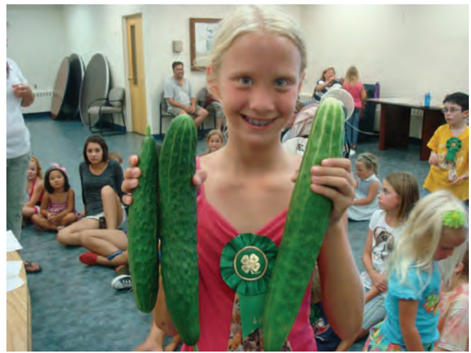
Mighty Middletown Club members make healthy snacks..