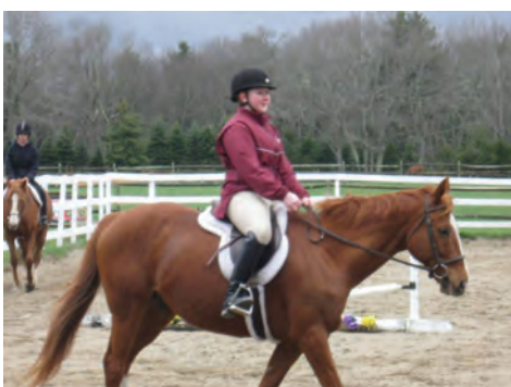
Military Club member working on her horse project.