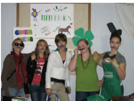
Jitterbugs club members prepare for a skit at the Big E.