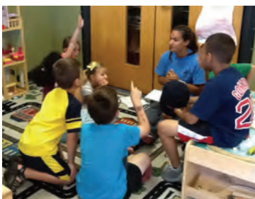
4-H members learn to plan a project and work as a team.