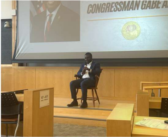
Congressman Gabe Amo at Rose Butler Browne Women of Color Conference