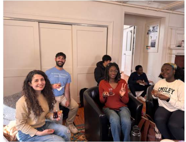
Women's Center x Office of International Students and Scholars Spill the Tea Event