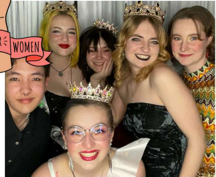
GSC Queer Prom