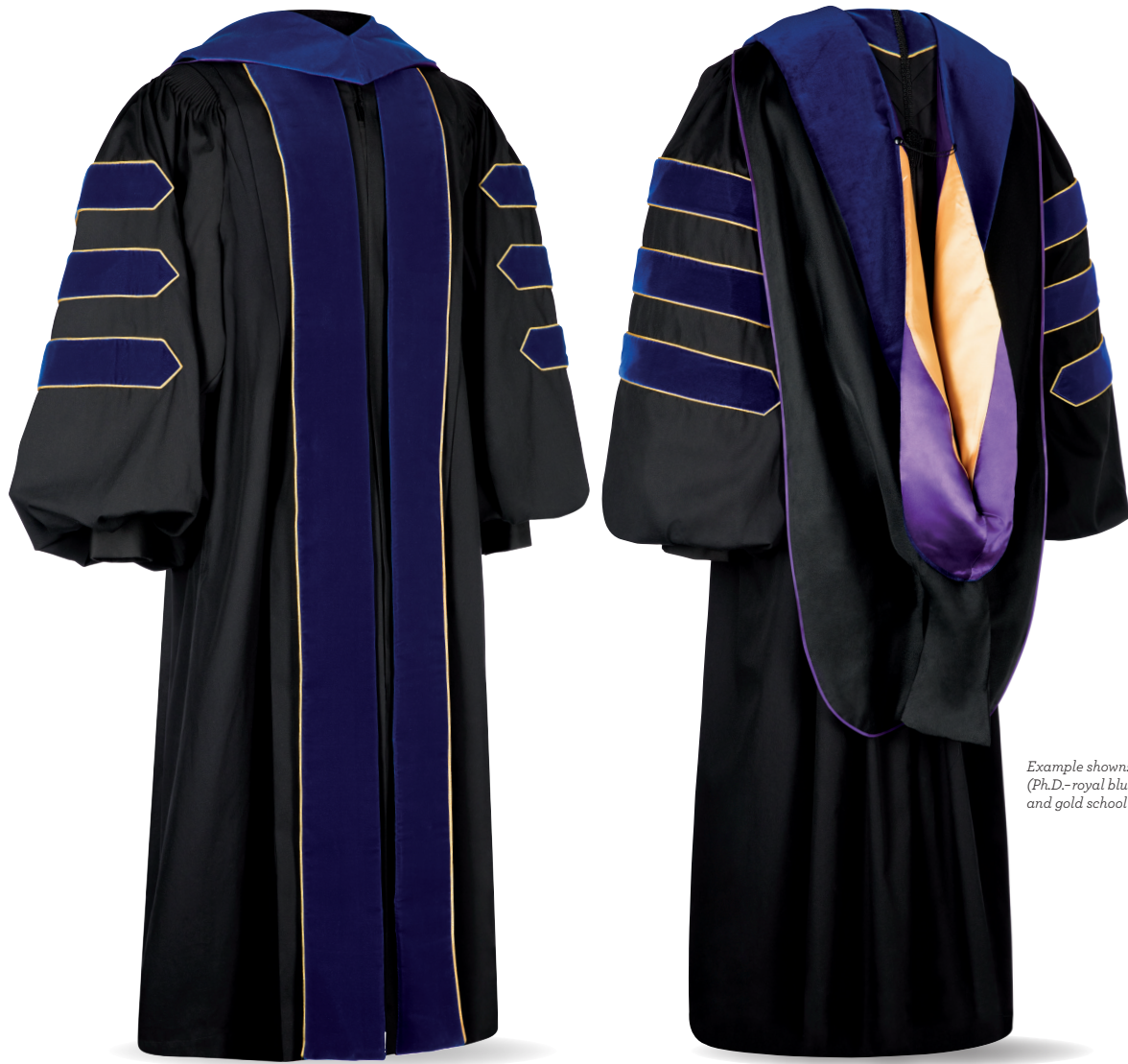
Example shown: Doctor of Philosophy (Ph.D.-royal blue velvet) with purple and gold school color satin lining.