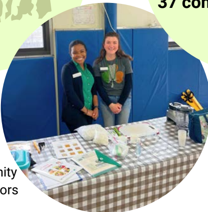
EFNEP Community Nutrition Educators

Quote from an elementary school program participant: "These grains that you are showing us look just like the grain foods my bird eats! I will eat whole grains just like her!"