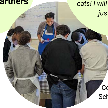
Cooking Demo with School-Aged Children