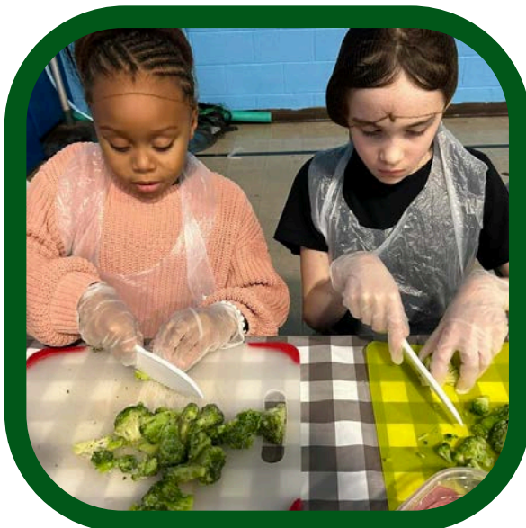
Two youth participants learning knife skills at an after school program