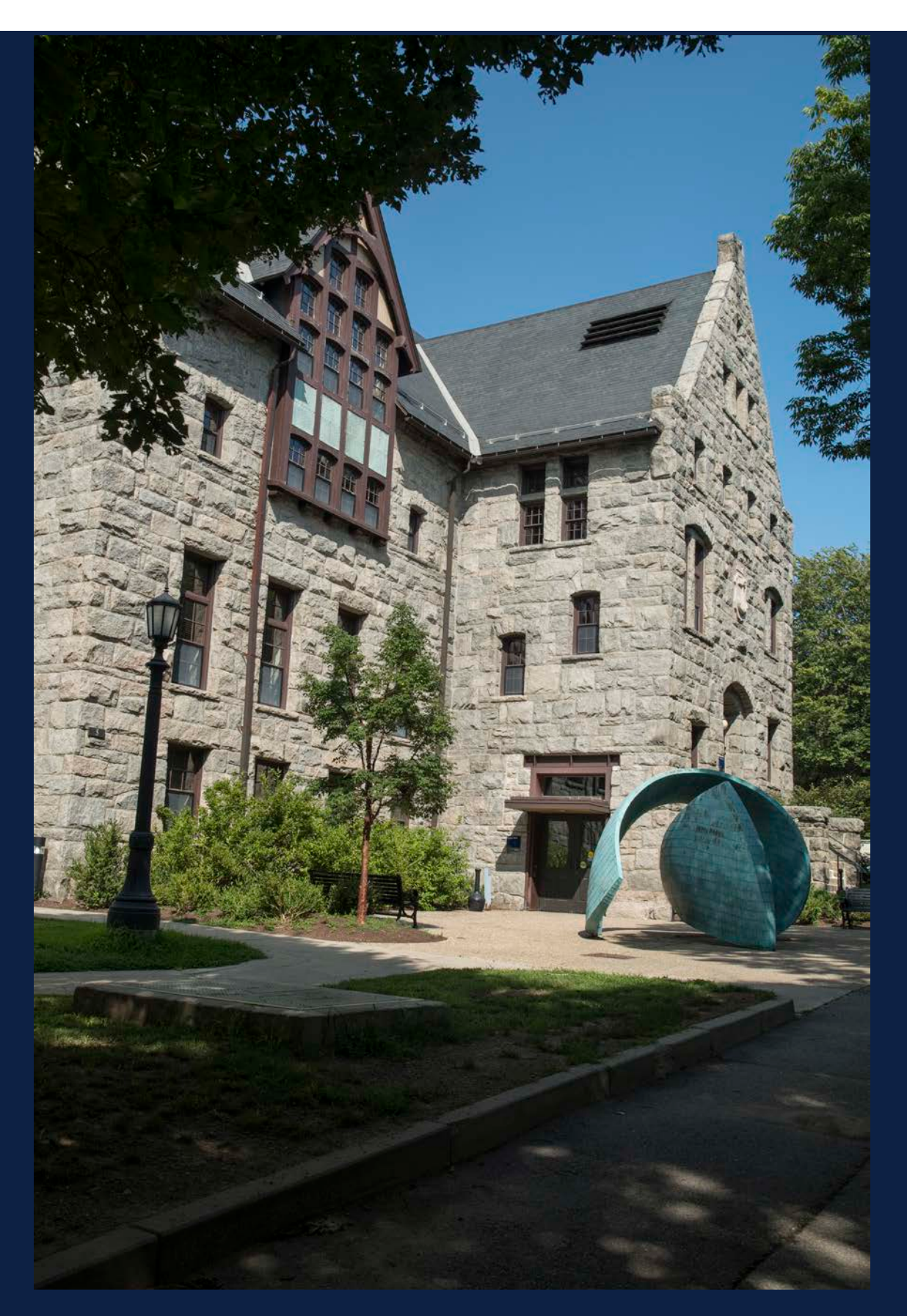
Historic Lippitt Hall, home of the Honors Program on the URI campus.