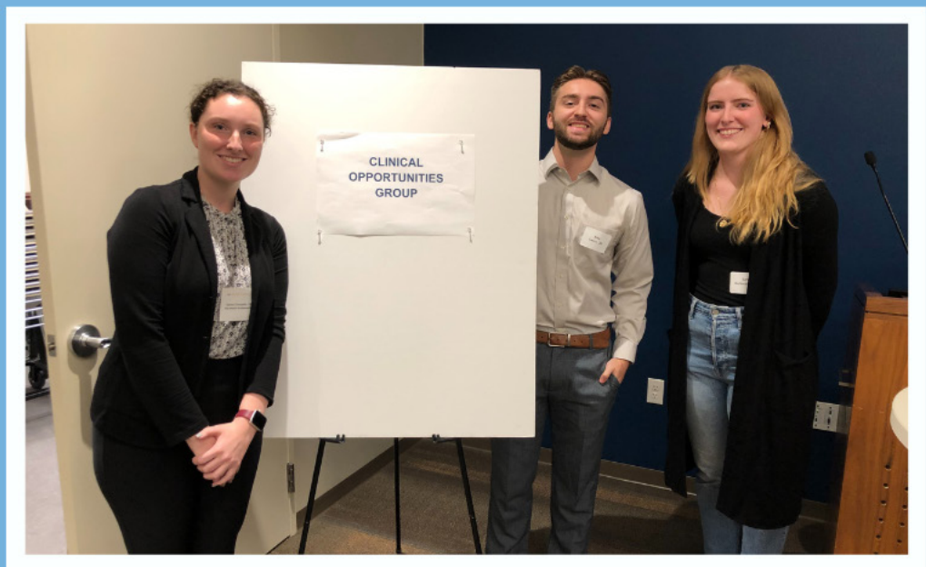
Pre-Health students learn directly from each other and from alumni at Pre-Health Experience Night.