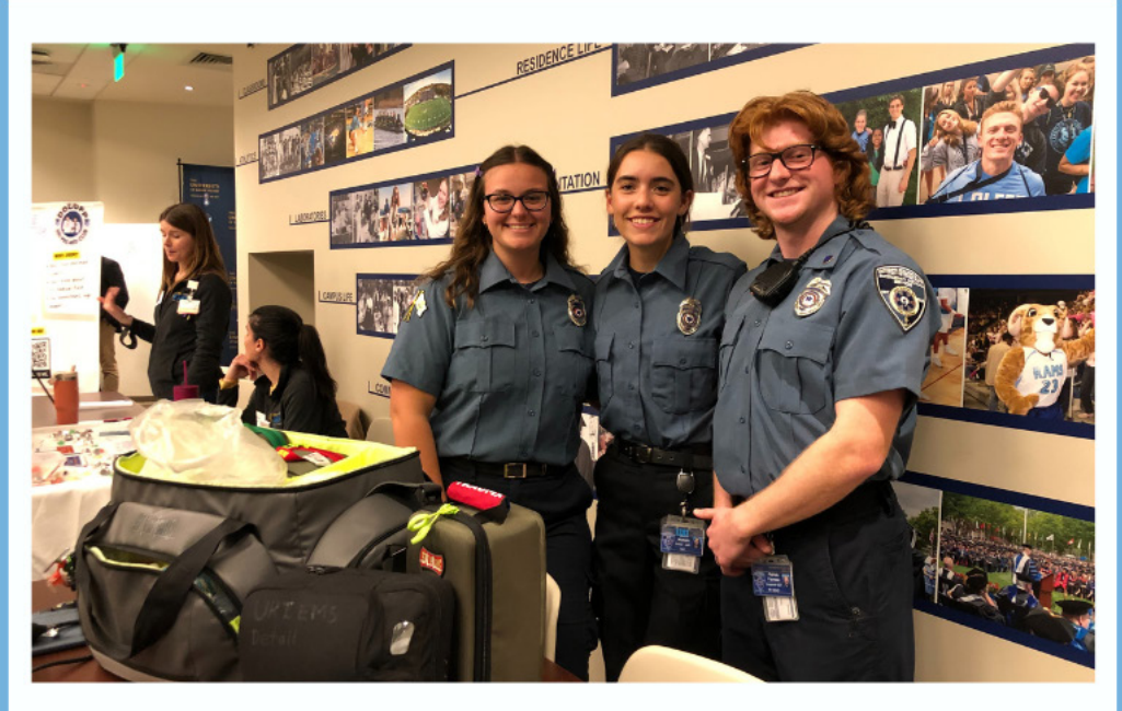
Many Pre-Health students gain valuable experience by volunteering for URI Emergency Medical Services.