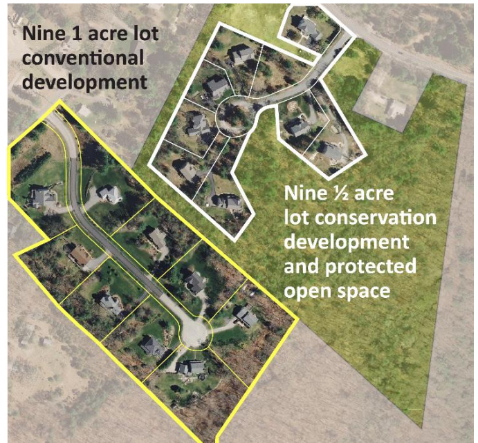
RIGHT: The conservation development outlined in white with nine 1/2 acre lots retains trees on lots and preserves 13 acres of forested open space. The conventional development in yellow with nine one-acre lots has a much longer road and lots clear cut for lawns, resulting in much higher runoff and no open space (RIDEM Environmental Resource Map & South Kingstown Web GIS).