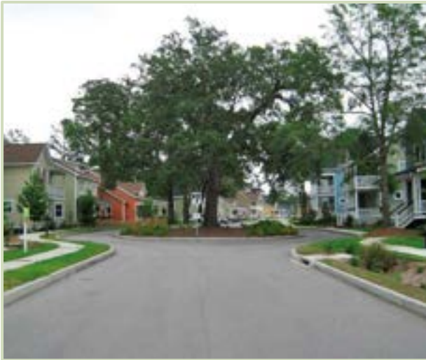
LEFT: Preserving even single mature trees reduces runoff, adds character, and provides cooling shade.

Avoid impacts by preserving and protecting as much of the natural site condition as possible. Compact development paired with protected open space is one of the most effective strategies.