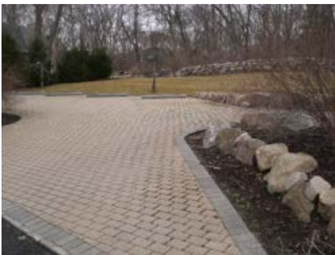
This permeable paver parking lot in Charlestown, RI, reduces runoff and uses the minimum number of parking spots.

Reduce impacts by minimizing the amount of impervious surfaces (such as pavement, rooftop, and compacted soil) which don't allow rainfall to soak into the ground.