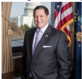
Joe Morelle, United States Congressman, NY 25th District

Congressman Morelle will discuss the state of national politics, his priorities in Congress, and how bipartisan collaboration can help advance our shared goals and effect long-term change. He is proud to represent New York's 25th Congressional District which includes Monroe County and a section of neighboring Orleans County.