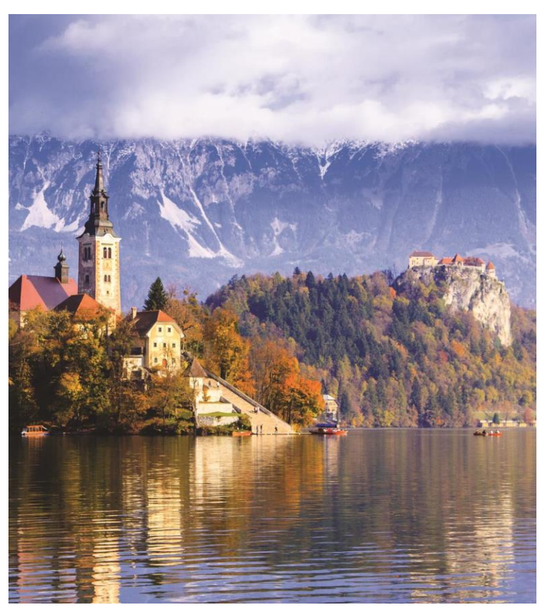
12 Days • 17 Meals: 10 Breakfasts, 2 Lunches, 5 Dinners

HIGHLIGHTS... Dubrovnik, Plitvice Lakes National Park, Ljubljana, Lake Bled, Opatija, Istrian Peninsula, Farm-to-Table Dinner, Split, Diocletian's Palace