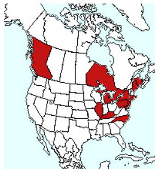
Native to Europe and western Asia, Often planted near seashores in zones 4-7 and known to naturalize.

Additional Range Information: Acer pseudoplatanus is planted in the USDA hardiness zones shown above and may seed into the landscape. See states reporting sycamore maple.