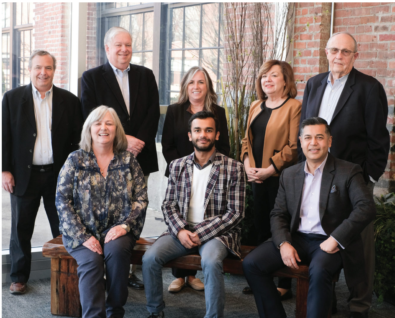
The RISBDC full-time staff.