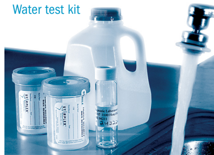
Water test kit

TIP: Lab websites give details about standard water testing packages and costs. You can also call the labs for this information. The yearly tests cost about $100.