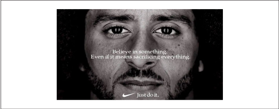
Figure 17. Nike's Kaepernick ad, which became the basis for memes.