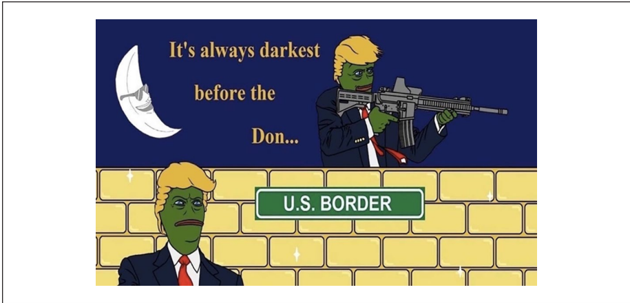
Figure 1. An example of a pro-Donald Trump alt-right meme.

For instance, the conservative activist organization Turning Point USA has received funding to both train right-wingers in the production of memes and to produce memes criticizing big government (Mencimer, 2019). Construction of these memes emphasizes humor, irony, and satire to help spread conservative ideas that also promote ideological messages of White supremacy, Islamophobia, and misogyny (see Figure 1). The rhetorical strategy of humor and irony enables the group to strategically distance themselves from the more explicit rhetoric of hate groups and message boards committed to these ideological standpoints (Wilson, 2017). This strategy is key to both recruitment and spread of their message.