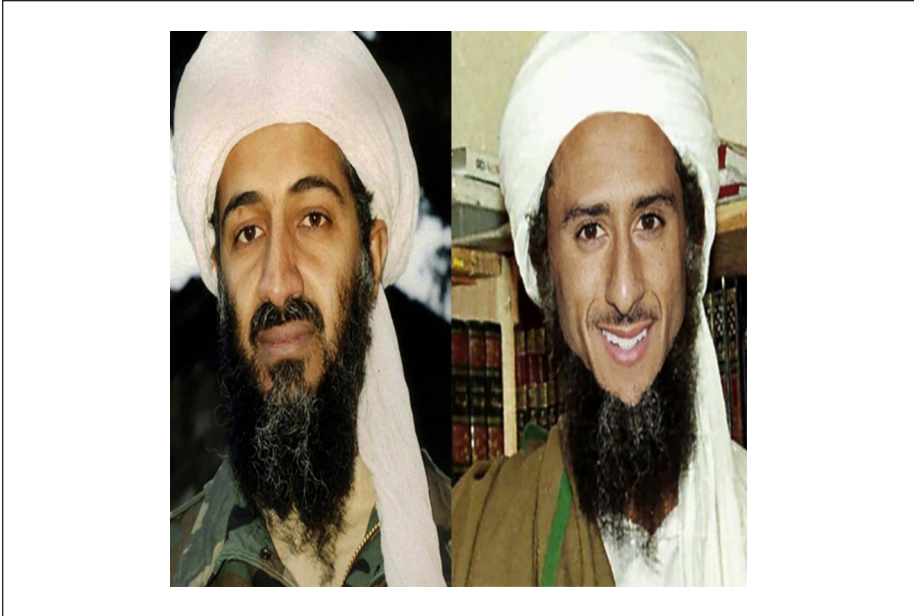
Figure 14. A meme equating Colin Kaepernick to Osama bin Laden.

After 9/11, the redeployment of Orientalist tropes helped to conflate anyone that appeared Middle Eastern, Arab, or Muslim as a terrorist (Volpp, 2002). Consequently, skin tone, religious symbols, and Islamic dress become the signifiers of terrorism and un-Americanism. Furthermore, the current alt-right movement perpetuates the belief that Islam, feminism, multiculturalism, immigration, and globalization are responsible for the slow destruction of Western civilization (DeCook, 2018). In Figure 14, a photoshopped Kaepernick appears with a turban and a beard situated next to and in similar garb, Osama bin Laden. Kaepernick is neither Middle Eastern, Arab, nor Muslim, but his brown skin connects him visually to bin Laden, thus rendering him a terrorist. The visual also directly equates Kaepernick with two of the largest perceived threats to the stability of Western civilization and American hegemony, Islam and Osama bin Laden.