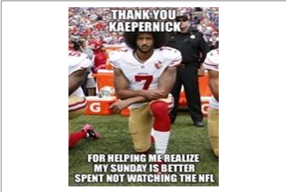
Figure 5. An example of a meme showing a negative reaction to Kaepernick’s protest.