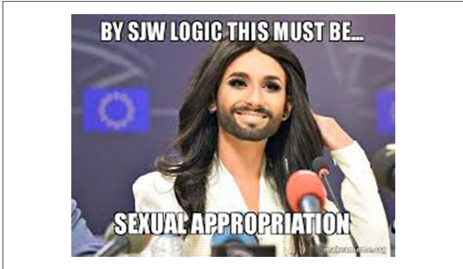
Figure 2. An example of an alt-right meme.

sexualized, and gendered meanings of nation are constructed on digital platforms, and the dissemination of these digital artifacts hail other individuals that identify with this specific form of U.S. patriotism in Donald Trump's America