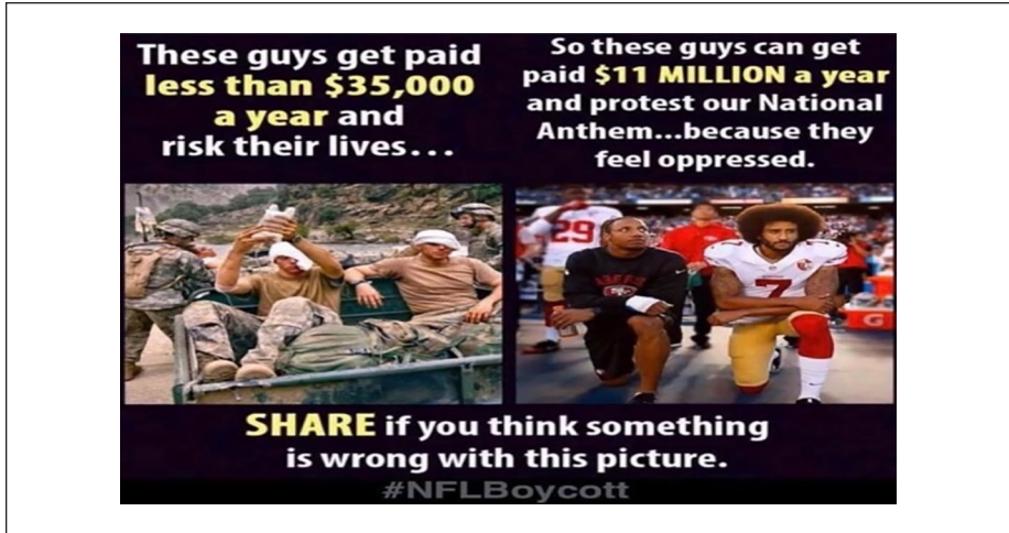
Figure 16. A meme juxtaposes images of US military with Kaepernick & teammate Eric Reid protesting to show that US military are the real heroes.

between Whiteness, morality, and the nation through the celebration of White masculine heroes (Kusz, 2007). This explicit discursive framing is seen in Figure 16.