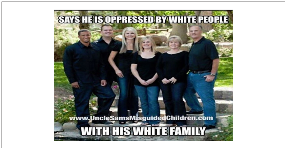
Figure 8. A meme about whiteness supposedly saving Kaepernick.

accentuates suggests that the presence of “good” White people in Kaepernick’s upbringing means that he could not feasibly be racially oppressed. Hence, not only is the support of Kaepernick a liberal agenda, the oppression of Black bodies the