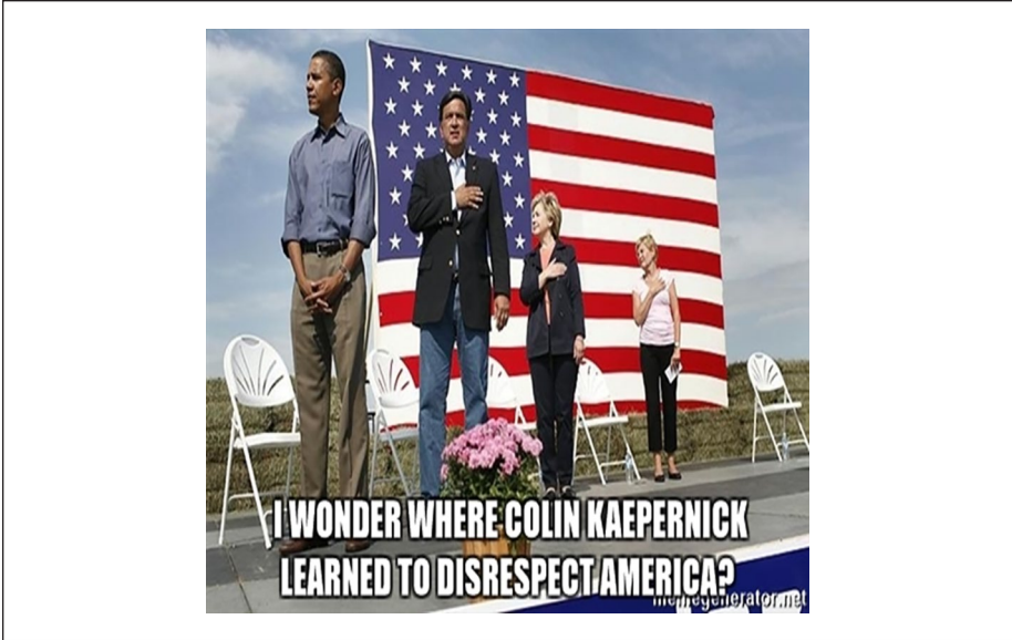
Figure 13. A meme where President Barrack Obama’s “disrespect” for the US is a model for Kaepernick.

learned to disrespect America?.” Initially, the floating flag and the differing eye-lines of the people indicate the image’s obvious edited creation. Drawing upon popular discourse equating protest during the national anthem to being disrespectful to the flag and nation, the meme constructs a discursive bridge between Kaepernick, Obama, and anti-Americanness. In a subtle act that positions White masculine adherence to performative national acts as the most important, it is noteworthy that all the figures performing patriotism correctly are White, and the second largest person in this image is the White man who is both bigger and in front of the two White women in the meme.