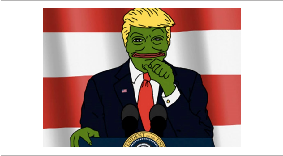
Figure 3. A meme merging Donald Trump and Pepe the Frog.