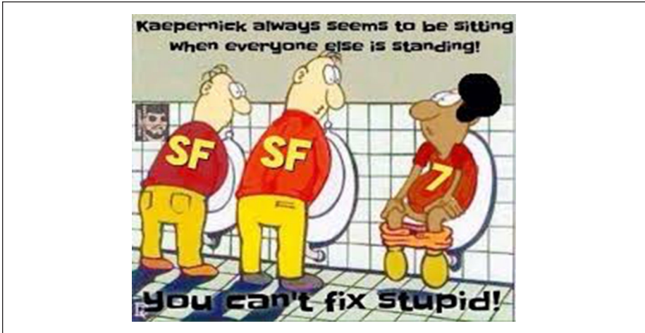
Figure 10. A meme depicting Kaepernick as both unintelligent and feminine.

framing of people pushing social justice measures as “snowflakes” (Hawley, 2017). Utilizing Kaepernick to demonize femininity and homosexuality through racialized, gendered, and homophobic discourse results in the antithesis of these identity markers White, masculine, and heterosexual situated as the norms within sport and larger society.