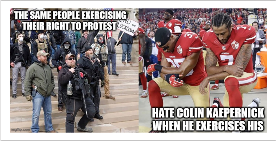
Figure 19. A meme comparing anti-lockdown protestors to Kaepernick.