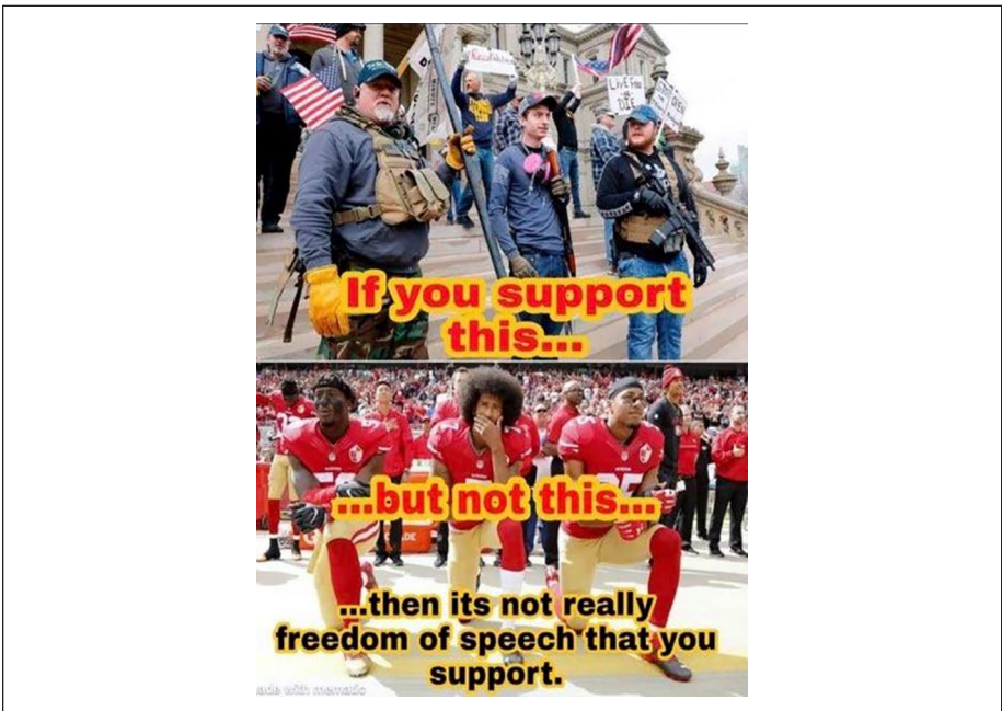
Figure 20. A meme comparing anti-lockdown protestors to Kaepernick II.

debates of race, gender, and the nation are rearticulated into digital racial formations via memes (Nakamura, 2008). As seen in Figures 19 and 20, a protest during the height of a pandemic, backed by right-wing organizations and performed by