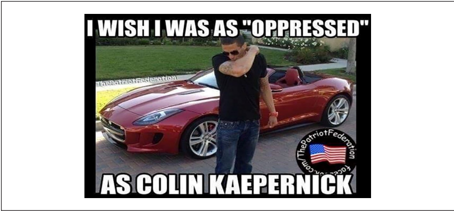
Figure 9. A meme denying racism due to Kaepernick's relative economic status.

equivalent of being sacked within an NFL game, but Whiteness has actually provided Kaepernick with an opportunity for a stable family structure and (visually) rendered his claims of (structural) racism as hypocritical through a reference to an aspect of individual life.