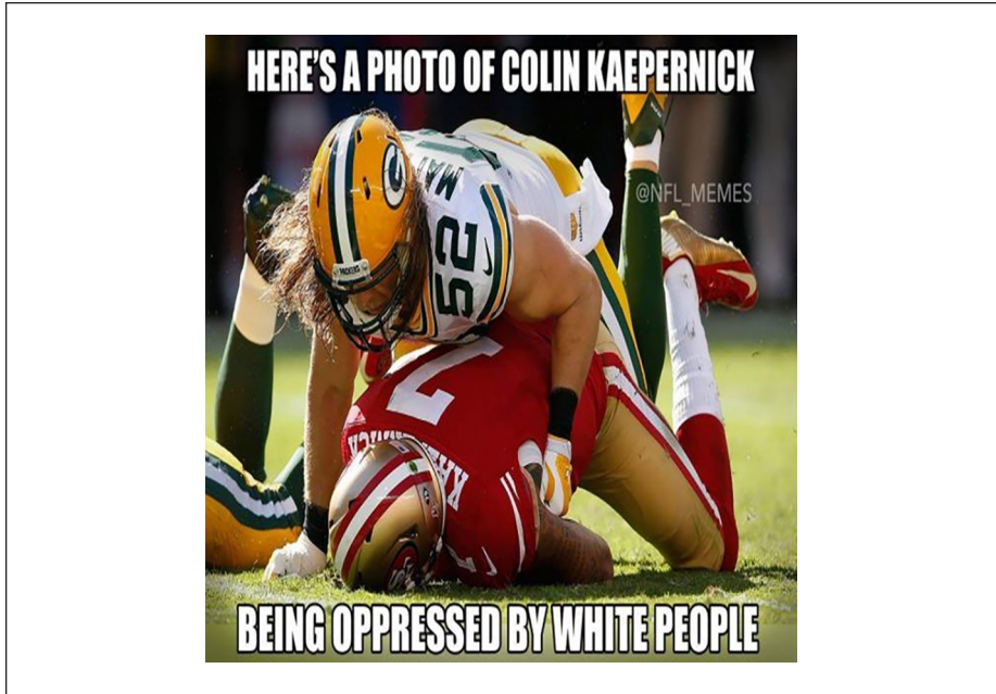
Figure 7. Institutional racism reduced to a performative act within sport.