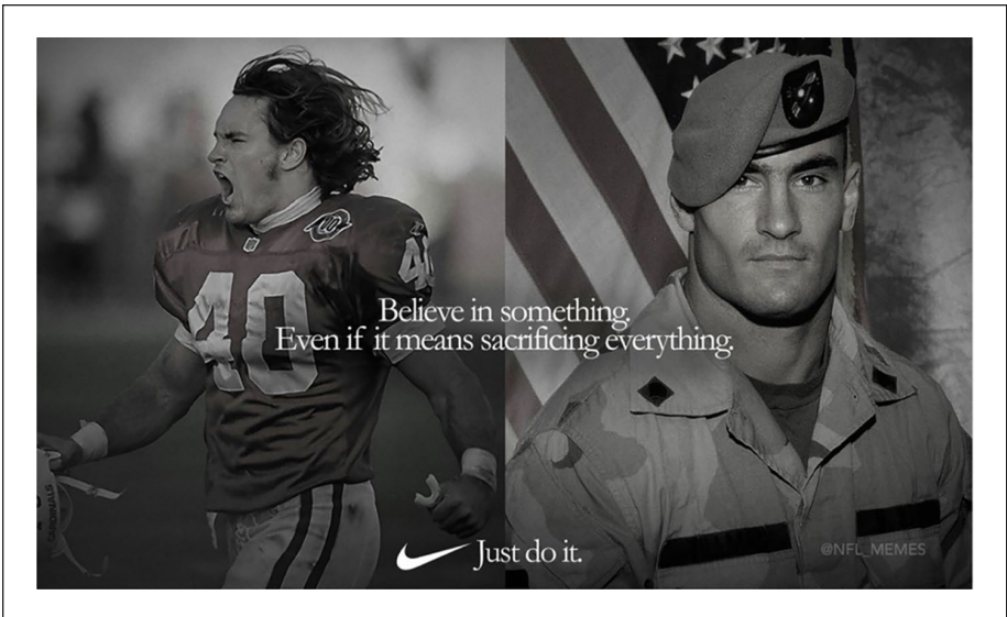
Figure 18. A meme remixes popular images of the late Pat Tillman with the Nike Kaepernick ad.

with the slogan “Believe in something. Even if it means sacrificing everything.” over a Black and White close-up image of his face (Figure 17). Predictably, the advertisement was polarizing, as can be seen in Figure 18, a meme that used the same Black-and-White color scheme and the same slogan. But, in this meme, Kaepernick’s face was replaced with two popular images of a uniformed Pat Tillman. The first image is of Tillman running helmetless in his Arizona Cardinals #40 jersey, hair flying and mouth open in a yell and the other is a formal portrait of him in his Army uniform in