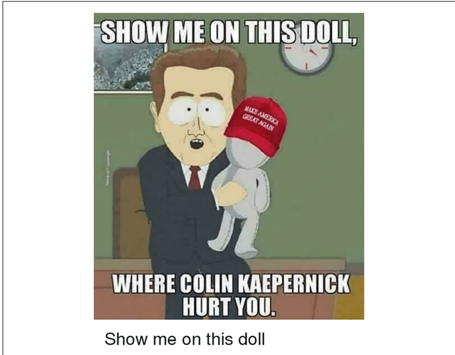
Figure 15. A meme uses images from South Park to depict Kaepernick as a sexual predator.