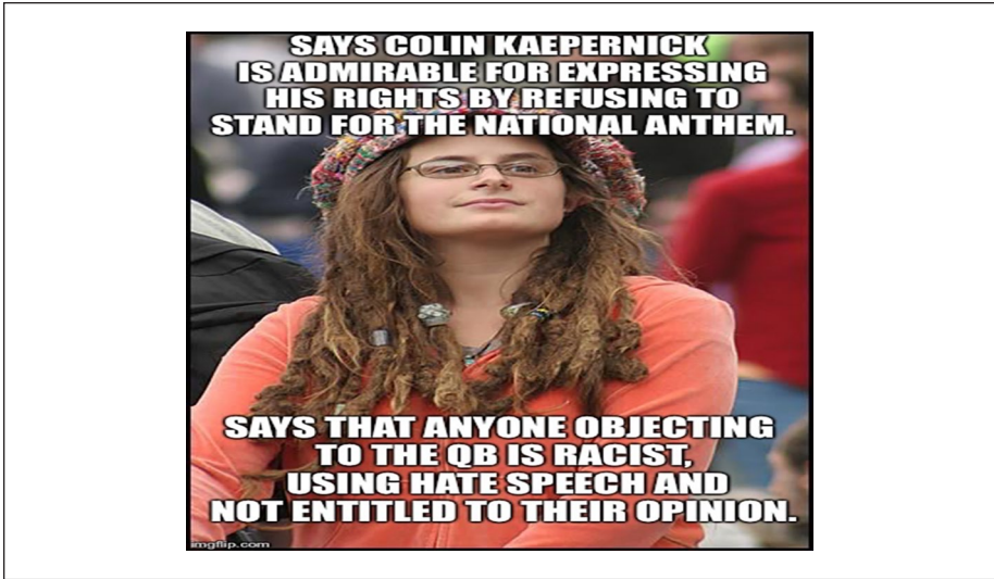
Figure 6. A meme about liberal ideology & PC culture.

four memes in each section to provide adequate space to develop a deep and critical analysis.