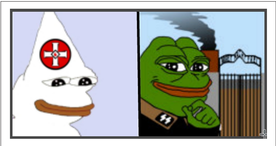
Figure 4. A meme depicting Pepe the Frog as a symbol of White Supremacy.

progressive agendas (Woods & Hahner, 2019). It is also a way to express White, heterosexual, men's anxieties about their place in the national imaginary by mocking what is perceived as a threat to their privileged status. In our following analysis, we demonstrate how sporting memes are embedded within the alt-right's ideological battle.