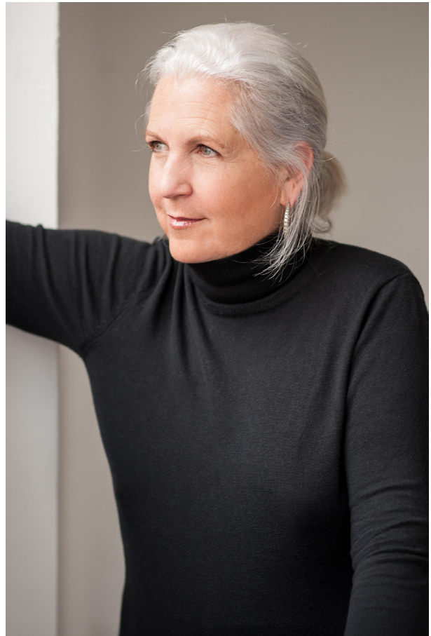
Terry Tempest Williams