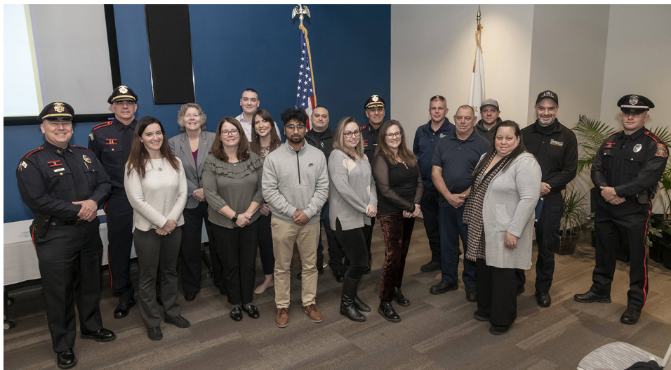
URI Public Safety Department