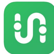
Transit App RIPTA bus schedules