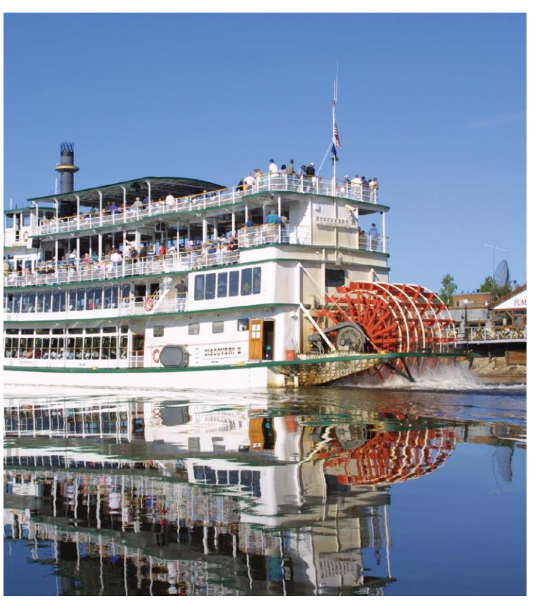
12 Days ● 26 Meals : 11 Breakfasts, 7 Lunches, 8 Dinners

HIGHLIGHTS... Fairbanks, Sternwheeler Discovery, Music of Denali Dinner Theater, Denali National Park, Tundra Wilderness Tour, Luxury Domed Rail, Anchorage, Hubbard Glacier, Glacier Bay, Skagway, Juneau, Ketchikan, Inside Passage