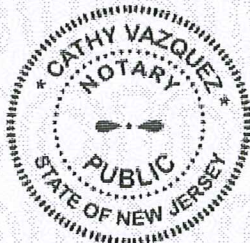
A NOTARY PUBLIC OF NEW JERSEY My Commission Expires Mar. 27, 2014

IN TESTIMONY WHEREOF, I have hereunto set my hand affixed my Official Seal, at the City of Newark, New Jersey the day and year first above written.