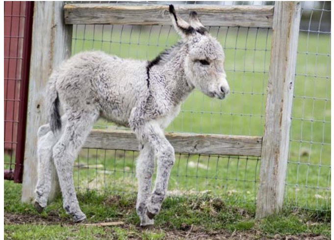
Peckham Farm's newest guard donkey

Peckham Farm, located across Route 138 from the URI athletic facilities, has sheep, cows, pigs and goats that are used as part of the University’s animal science and pre-veterinary classes.