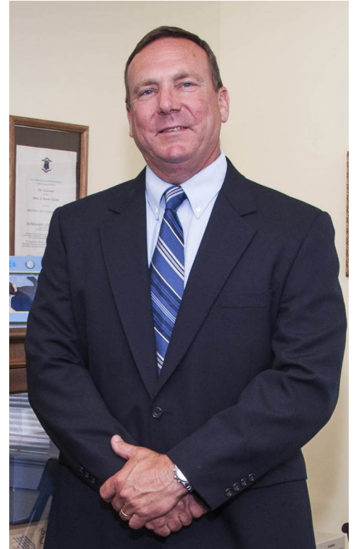
URI Photo by Michael Salerno Photography