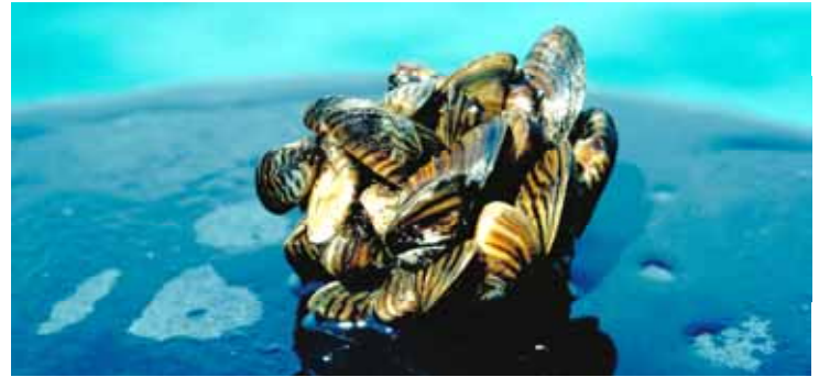
Fig 5 (above): Zebra mussels can quickly colonize any surface in their habitats, including the shells of native freshwater mussels like those above have done