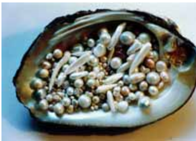
Fig 7 (left) Mussel populations declined in the 1800s and early 1900s because they were harvested for the pearl button industry and, to a lesser extent, freshwater pearls. (left; credit USFWS and Mississippi River Pearl Jewelry Co.)

The U.S. Environmental Protection Agency (EPA) classifies freshwater mussels as biomonitors because they react to changes in the surrounding environment. Like many other freshwater macroinvertebrates, they are considered indicator organisms because they can show changes in the environment not shown by other organisms. Mussels have a range of tolerances to changes in water flow, changes in the substrate, increased silt, low dissolved oxygen, and intrusion by invasive species. Changes in mussel populations can be an early indicator of harmful impacts to a waterbody, such as industrial runoff or sedimentation caused by erosion. Furthermore, since mussels are filter feeders, they bioaccumulate metals and other contaminants in their bodies and shells (U.S. EPA). After mussels die, their spent shells leave behind a historical record of their presence that can be analyzed by researchers.