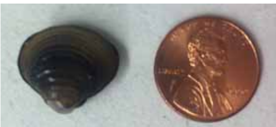
Fig 6 (below): The Asian clam, Corbicula fluminea has been found in Rhode Island since the 1990s

URI Watershed Watch volunteer monitoring data was used for a study on the growth rate of the eastern elliptio in Yawgoo, Tucker, and Worden Ponds (Kesler et al., 2007). The research showed that a mussel's growth rate is dependant upon the pond it resides in, and that mussels will preferentially allocate their energy to survival and reproduction before devoting energy to growth.