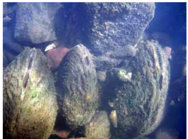
Fig 2 (above): Freshwater mussel beds increase the surfaces in a waterbody on which periphyton can grow