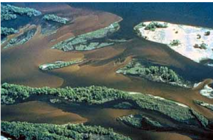
Fig 1 (below): The process of sedimentation harms freshwater mussels by burying them if they are unable to move to a new area quickly and by making filter feeding more difficult

One study (Vaughn and Spooner, 2006) found that the density of mussels in streambeds affects the variety of other macroinvertebrates , or small aquatic animals that lack backbones, present. Mussels create a more favorable habitat for other aquatic life by stabilizing streambeds, introducing more dissolved oxygen into the substrate by burrowing, moving nutrients from the water column to the benthos, and providing a surface on which periphyton , or a mixture of algae and microorganisms that attaches to submerged surfaces, can grow.