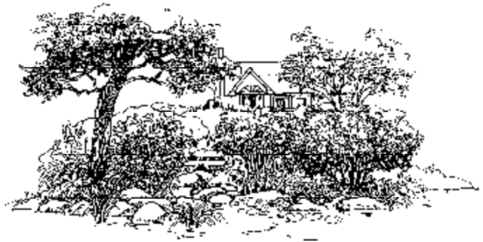
Fig. 2: A buffer zone of plants, shrubs, or trees between your property and your lake will help prevent phosphorus from entering the lake. This is just one way that you can help prevent cultural eutrophication in your lake.