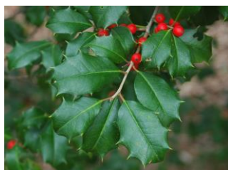
American Holly ( Ilex opaca )