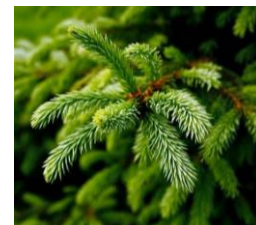
Norway Spruce ( Picea abies )