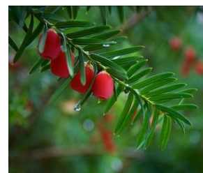
American Yew ( Taxus canadensis )