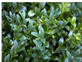
Boxwood ( Buxus ssp. )