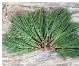
White Pine ( Pinus strobus )