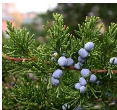
Eastern Red Cedar ( Juniperus virginiana )