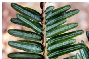
Eastern Hemlock ( Tsuga canadensis )

Gather your materials and find a clean workspace. You may find it useful to become familiar with these common Rhode Island evergreens: