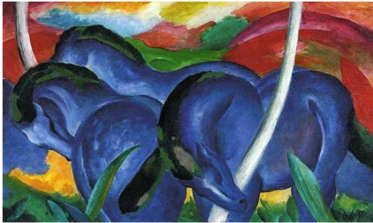
The Large Blue Horse by Franz Marc