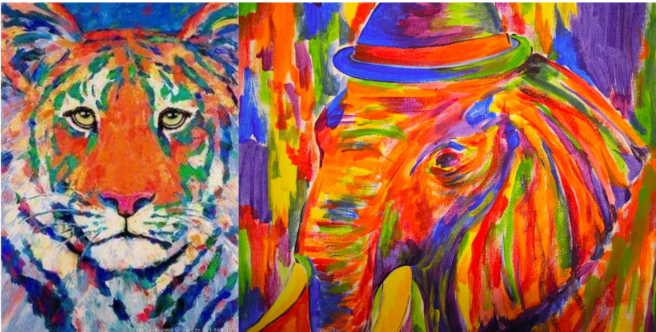
Tiger Giclee by Carol Korpi-McKinley

post impressionistic with symbolic color. Images are not completely realistic, but the bright colors try to show a mood. BOLD brush strokes, Don't over blend.