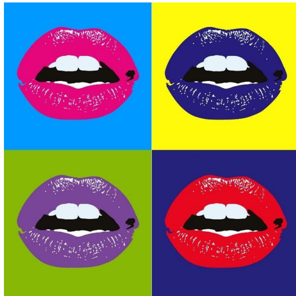
Marilyn's Lips by Andy Warhol