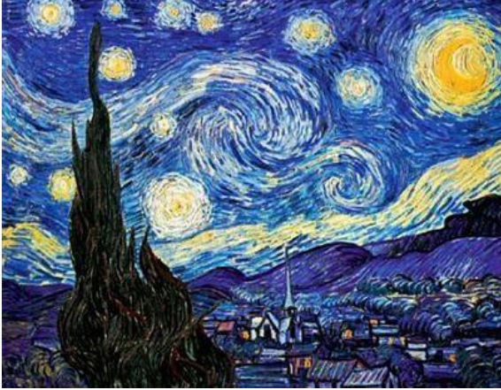
Starry Night by Vincent Van Gogh

Distorting the image to create a strong emotion in the viewer. Again it's not realistic and details its emotions.