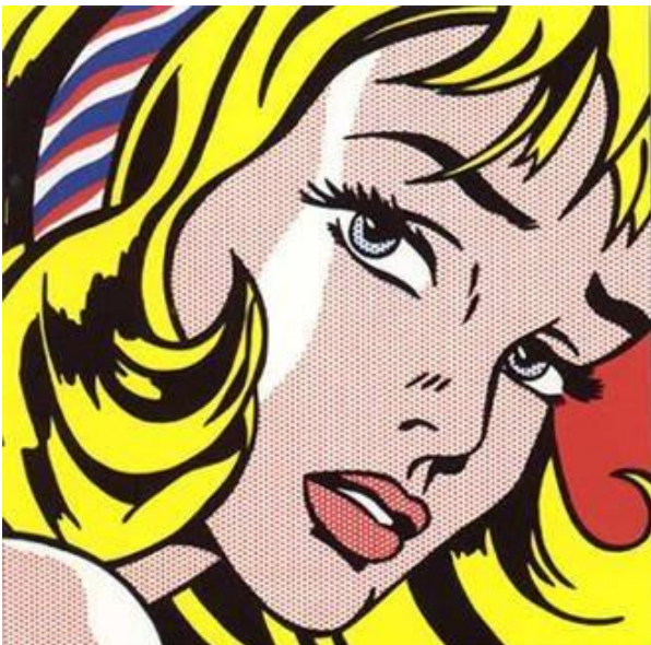
Girl with Hair Ribbon by Roy Lichtenstein

Blending high culture and low culture. Everyday things = art. Colorful. Sometimes has strong outlines.