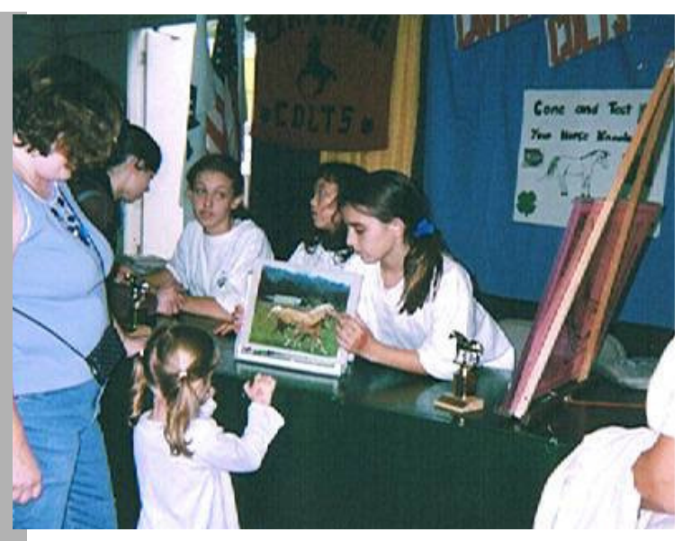
Cantering Colts 4-H Club demonstrating Horse Knowledge in the pods!

4-Hers can participate as individuals, with their club, or with another club. Cloverbud members can come up for the day to participate. Most public presentations are easily adapted to a pod demonstration or the stage!