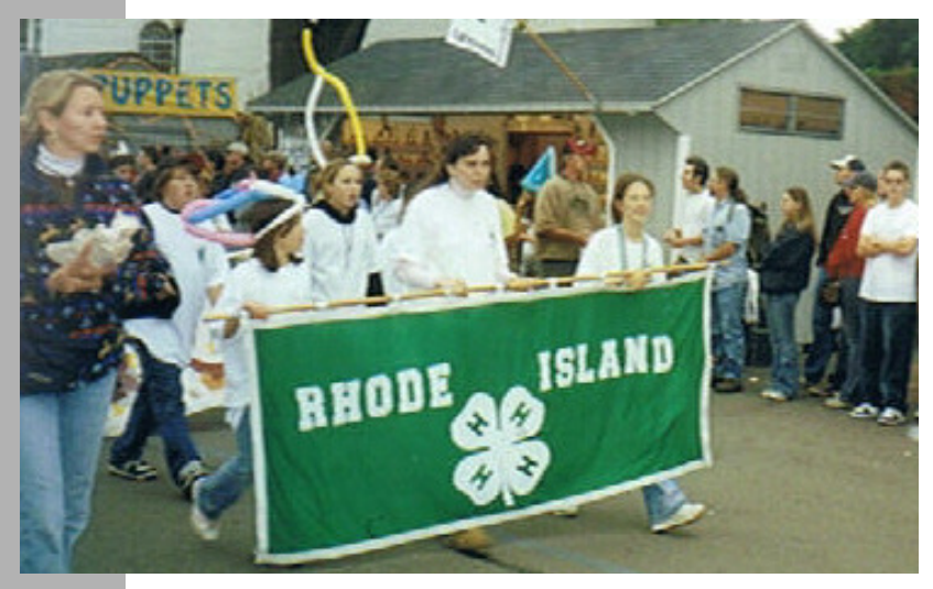
Rhode Island 4-Hers marching in the Big E parade!

THE SCHEDULE IS SET UP SO YOU HAVE PLENTY OF TIME TO ENJOY AND SEE THE FAIR!