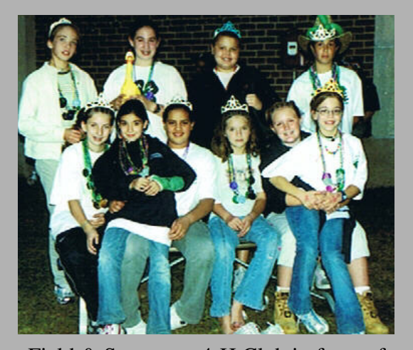
Field & Streamers 4-H Club in front of the 4-H Dorm at the Big E!