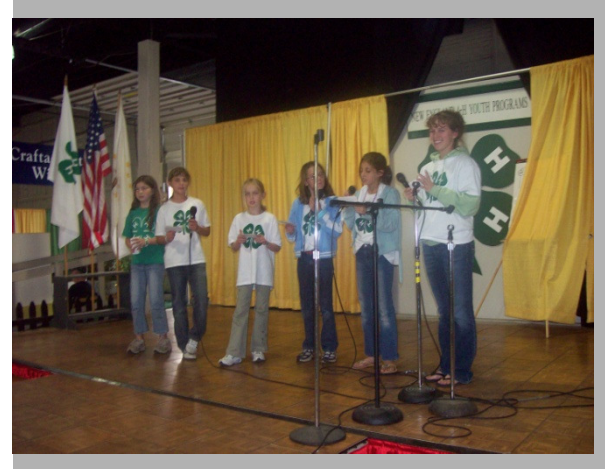
4-Ever Amigos doing a skit on stage.

The 4-H Stage: puppet shows, skits, interactive games with the crowd, speeches, music and singing are all great on the stage. Contact Kristy ahead of time to sign up for a stage act.