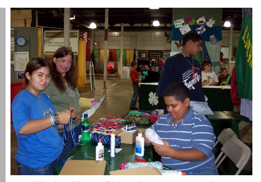
Millenium Library Club setting up demonstrations.

The 4-H Stage: puppet shows, skits, interactive games with the crowd, speeches, music and singing are all great on the stage. Contact Kristy ahead of time to sign up for a stage act.