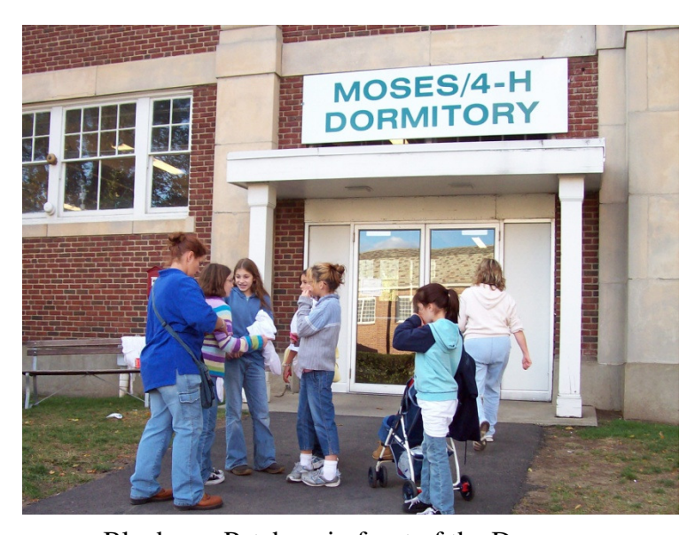
Blueberry Patchers in front of the Dorm.