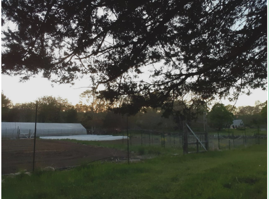
A quiet moment at the end of a long day at the Amos Greene Farm in Charlestown

percent cover by 95% to 100% at the time of removal