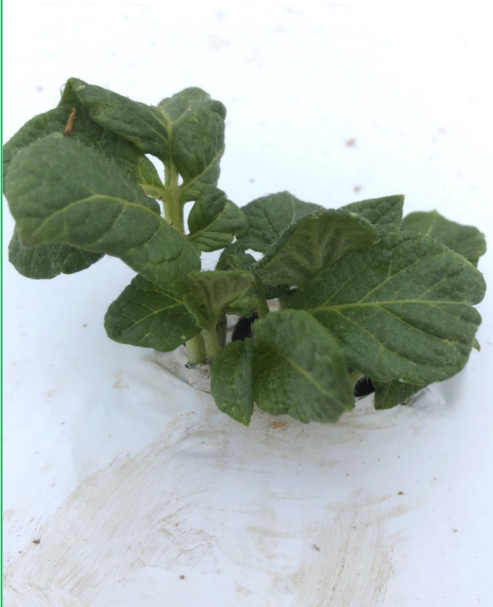
Pomme de Plastique-Blanc à la Ferme de Garman

Flea beetle pressure is as high as we have ever seen. There was a moment last week when we could actually see crowds of beetles jumping around on the row covers over the bok choy and tat soi. Later in the day, when the beetles were less active, we were able to take a look at the plants as we adjusted and tightened the covers. Actual infestation only worked out to one beetle per 24 plants, a pretty good argument for the efficacy of row cover. But we have the Pyganic ready, just in case.