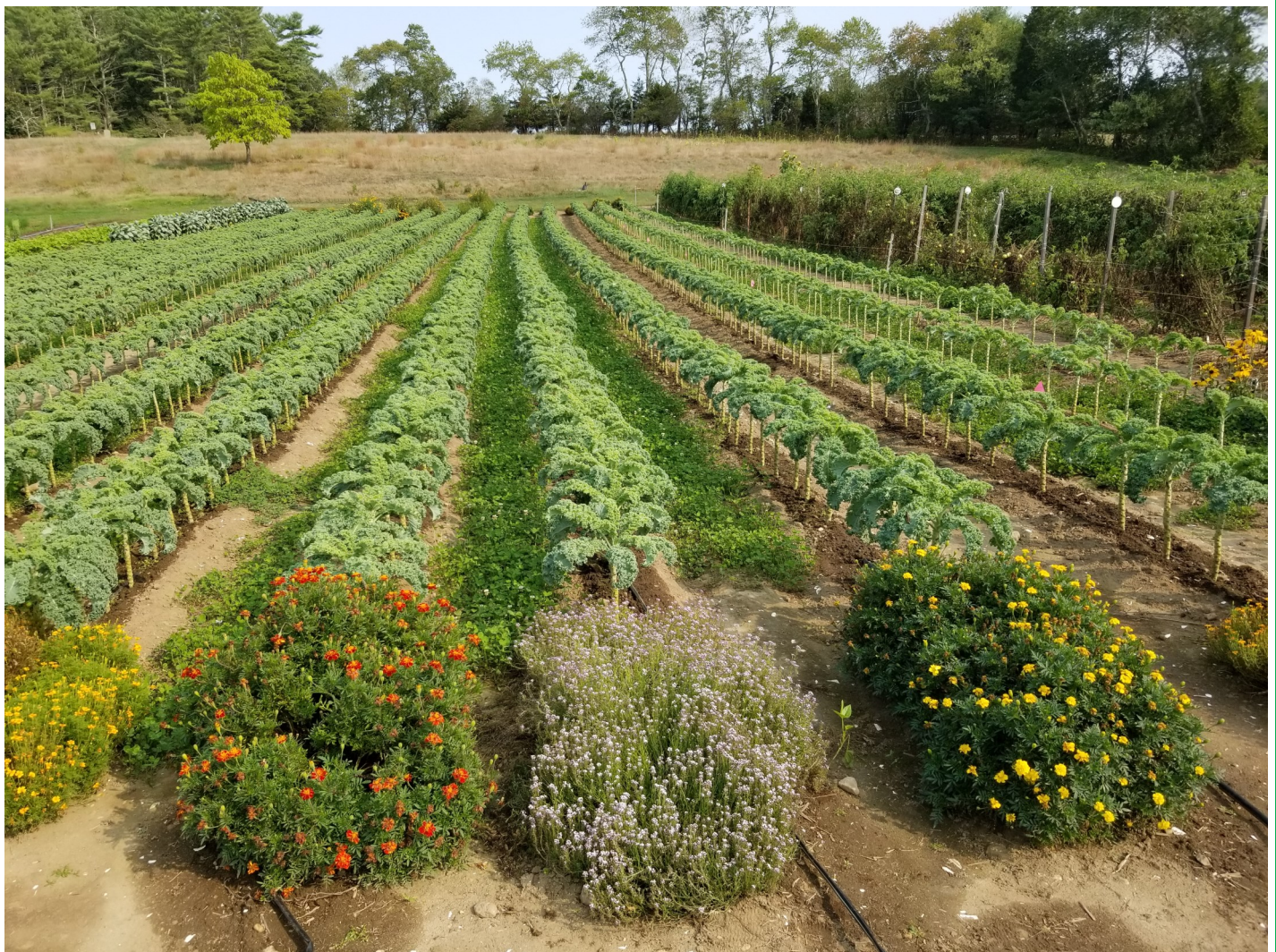
The beautiful fall garden at Arcadian Fields, Barberville, RI

Stay tuned for a future installment: What do your soil test results mean?