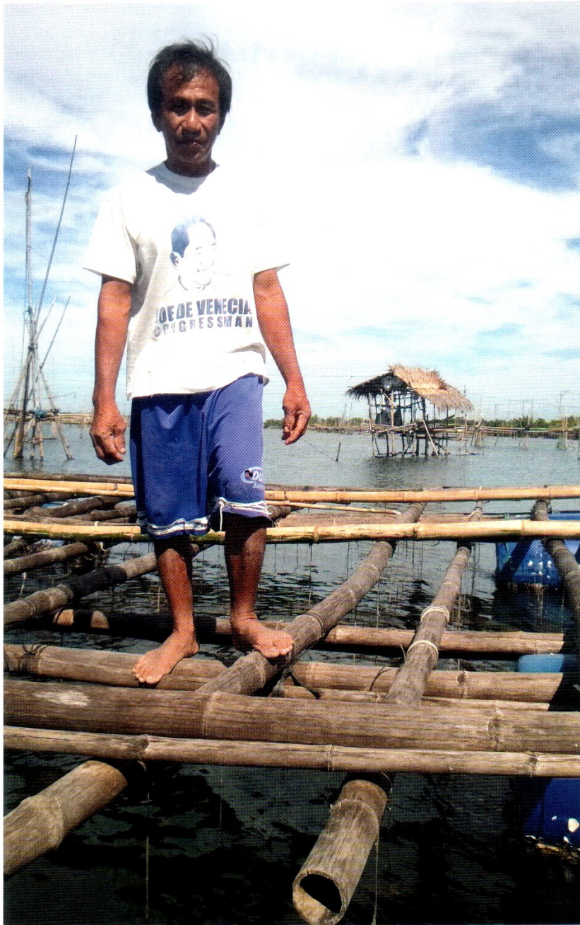
Dagupan City, Philippines oyster farmer January, 2017.

try's willingness to begin educating key elected decision makers about its value and potential for building economic stability in their estuary.