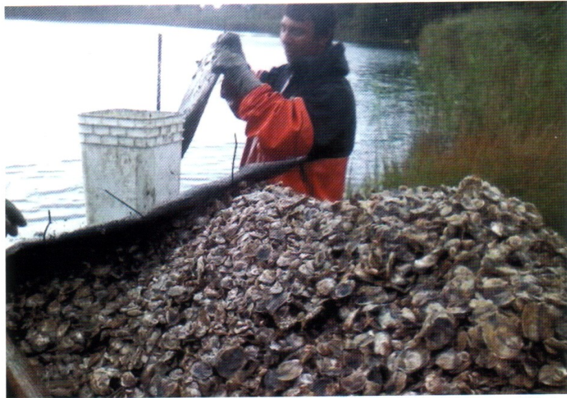
Watch Hill Oyster Company of Winnipaug Pond in Westerly Rhode Island, 2010.

Return to a modified form of the old informal IMTA system has been