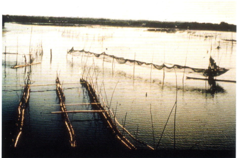
Figure 1. Oyster farm (foreground), fish traps, and floating net cage culture of groupers and sea bass (background near far shore) in the Dagupan City Estuary System 1983.