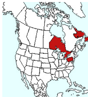
Native to Japan, planted as a timber tree and an ornamental in zones 4-7, known to escape.

Additional Range Information: Larix kaempferi is planted in the USDA hardiness zones shown above and may seed into the landscape. See states reporting Japanese larch.