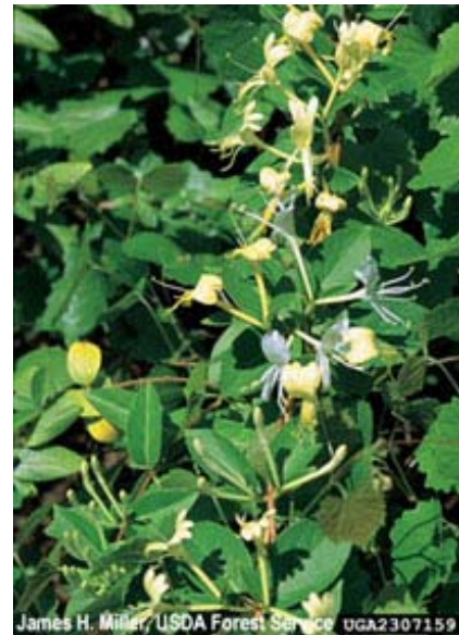
Leafy, climbing vine of Japanese honeysuckle.