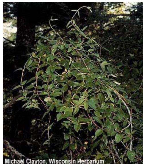
Michael Clayton, Wisconsin Herbarium

On Foresters: Tangled vines may hinder access to the forest and interfere with forestry operations such as reconnaissance. Safety of sawyers felling trees is compromised as trees fall in