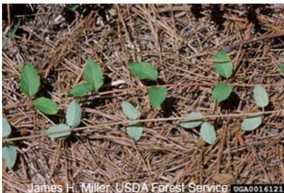
Leaves in pairs along stem, often with lighter green undersides.

Habitat invaded. Colonizes disturbed sites, open woods, woodland edges, forest openings, floodplains, fields, roadsides, barrens and