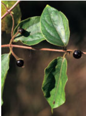
Ripe fruits are blue-black.