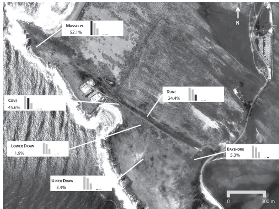
FIG. 2. Map of long-term sites at the Bodega Marine Reserve (BMR). Incidence rates reported per site are from long-term surveys carried out from 1993–2006 (redrawn from Ram et al., in press). Lines point to the approximate center of each long-term site.

EPN populations in the summer suggests that they may undergo seasonal vertical migration in the soil column. This migration may aid local population persistence (Mauleon et al., 2006). The cooler temperatures and increased moisture content of deep soils may allow EPN to conserve their lipid to later ascend up to the host-rich upper layers ('A' and 'O' horizons) with the onset of winter rains. We are currently testing this hypothesis, particularly how variation in lipid levels affect survivorship.