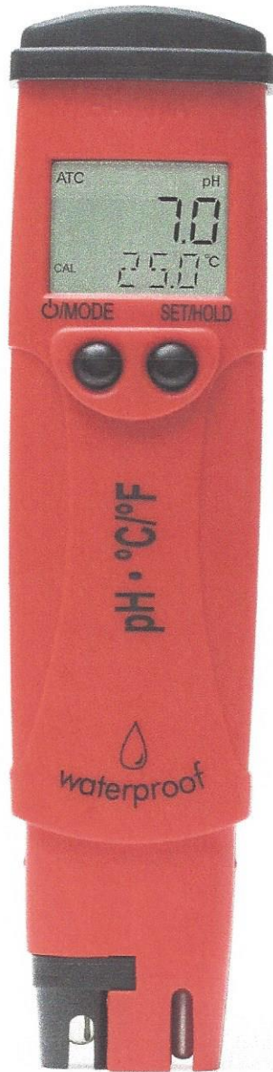
HANNA pH meter HI98127