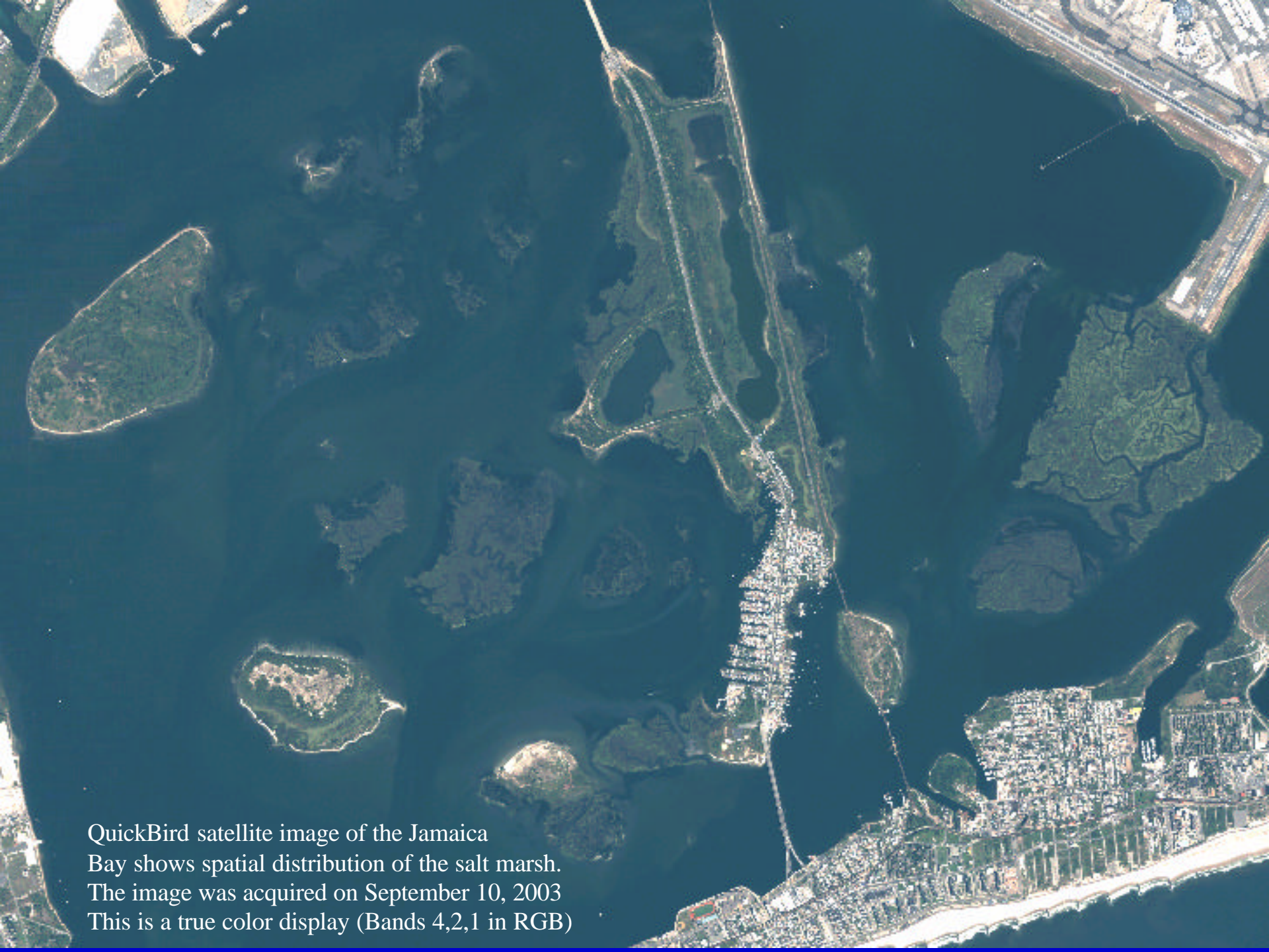
QuickBird satellite image of the Jamaica Bay shows spatial distribution of the salt marsh. The image was acquired on September 10, 2003. This is a true color display (Bands 4,2,1 in RGB).