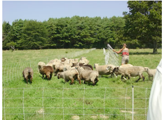
Watson Farm, Jamestown, RI. These sheep are being moved to a new section of pasture using portable electrified fencing.

When there is adequate pasture land, subdividing the area into paddocks that the animals graze for no more than one week at a time is crucial for optimizing pasture productivity and health. Otherwise, animals will start to re-graze the tender new shoots that are trying to re-grow, leaving less desirable forage to head out and go to seed, slowing down its growth and becoming less nutritious. This can actually lead to a situation where some of the area is being over-grazed and some of the area is being under-grazed at the same time.