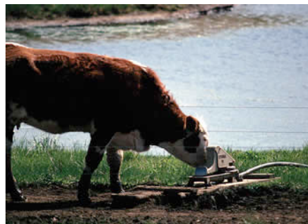
Nose-operated demand pump draws water from nearby surface water and eliminates shoreline access.