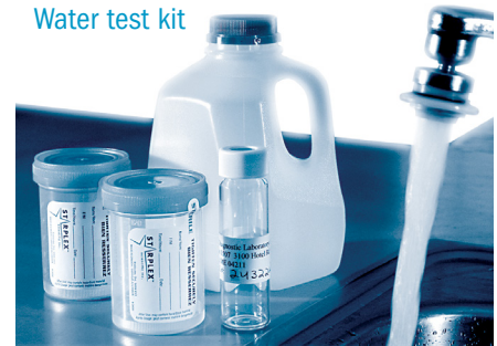
Water test kit

TIP: Lab websites give details about standard water testing packages and costs. You can also call the labs for this information. The yearly tests cost about $100.