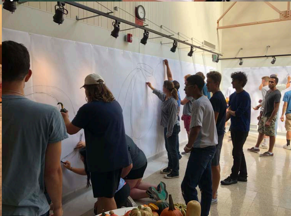
Students at Work