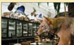
Nature Lab, Rhode Island School of Design, Providence

Rhode Island NSF EPSCoR supports four core research facilities to help discover the effect of climate variability on marine life. Each facility is open to researchers and students statewide. An inventory of available equipment and expertise can be found at www.riepscor.org .