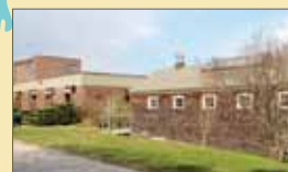
Marine Life Science Facility URI, Narragansett

Instrumentation for robotic sample preparation, fragment analysis, rt-qPCR, bioanalyzer