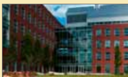
Genomics & Sequencing Center, URI, Kingston

Instrumentation for the physical characterization of biological macromolecules