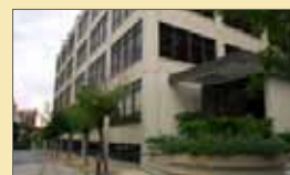
Proteomics Center, Brown University, Providence

A hands-on natural history collection and studio environment that offers the opportunity to examine and explore the patterns, structures and interactions of design in nature.