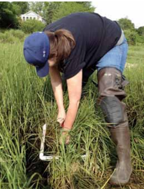
Janis Hall working in the field

The impact of this human source of nutrient enrichment, also known as eutrophication, can be seen in this vital ecosystem by increasing plant production, disease-causing bacteria, greenhouse gas emissions, and decreasing oxygen concentration within the water column.