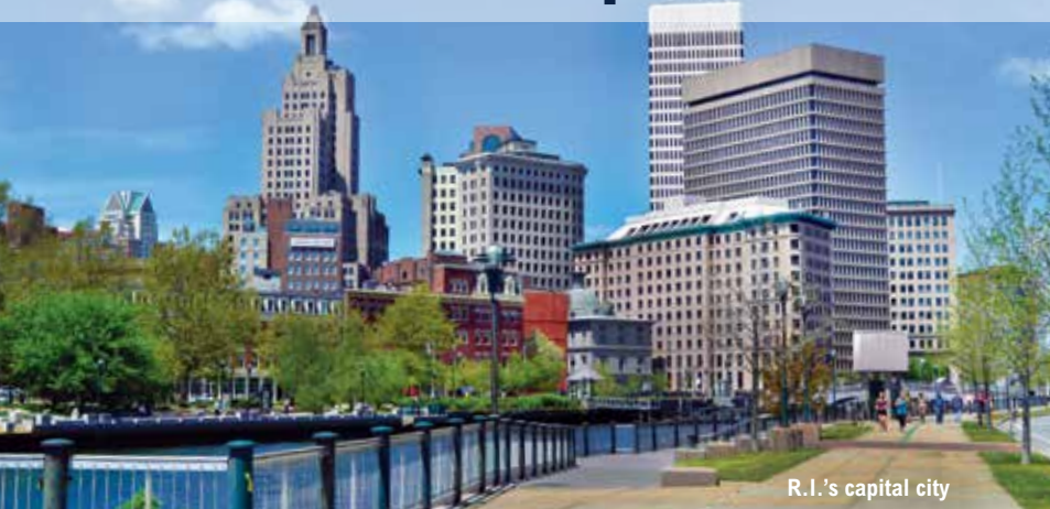
R.I.'s capital city

The Alan Shawn Feinstein College of Education and Professional Studies is home to two schools. The School of Professional Studies offers flexible degree and certificate programs. The School of Education, which is based at the Kingston Campus, offers a full range of undergraduate and graduate specializations.