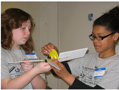
Measuring blade angle with a protractor

Teamwork Problem solving Innovation Tenacity