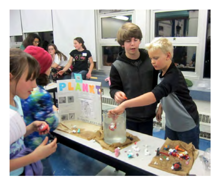
Students from Curtis Corner Middle School in South Kingstown taught their community about the importance of plankton in our oceans.