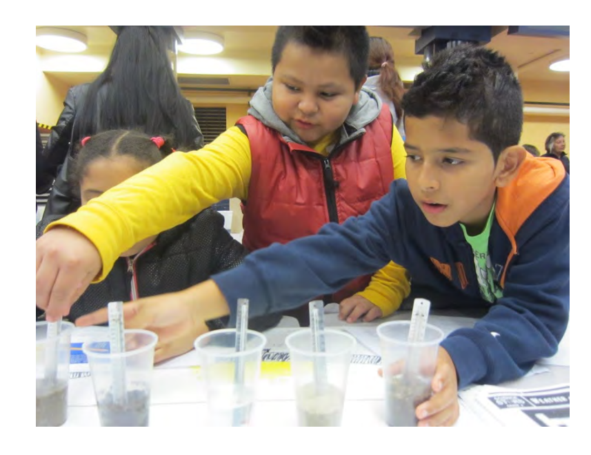
Students present hands-on activities from their Fall 2015 Ocean Curriculum