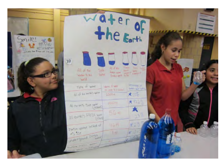
Students from Calcutt Elementary School in Central Falls demonstrated the limited amount of freshwater and the immense amount of saltwater available on our planet.